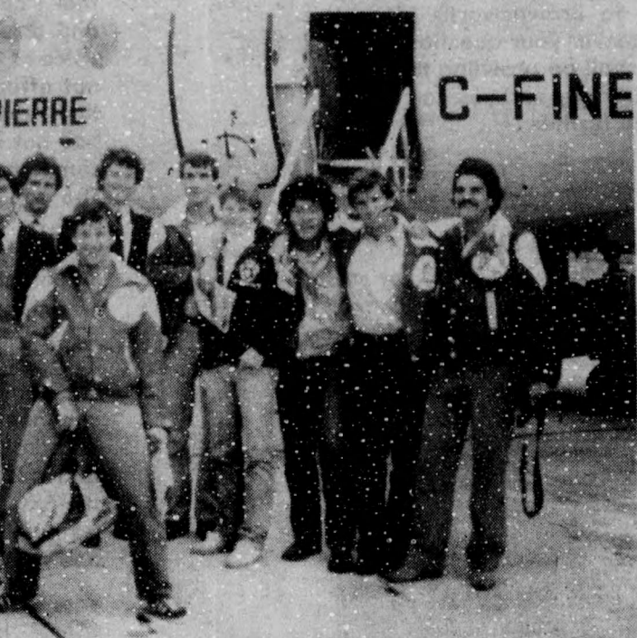
hirts - attempting to fly to great

m is off light a won ast, ex- r. This ent on en we mpion- bt that y Cour- Turpin, JAA or e many a team youth th con- tionally