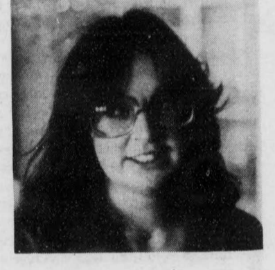
Arts I Dawn Upton What do I who?