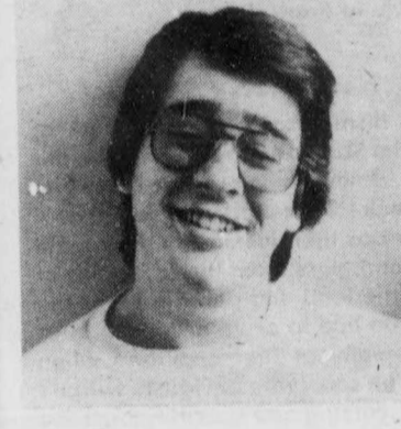
Arts I Bentley Hammer What election?