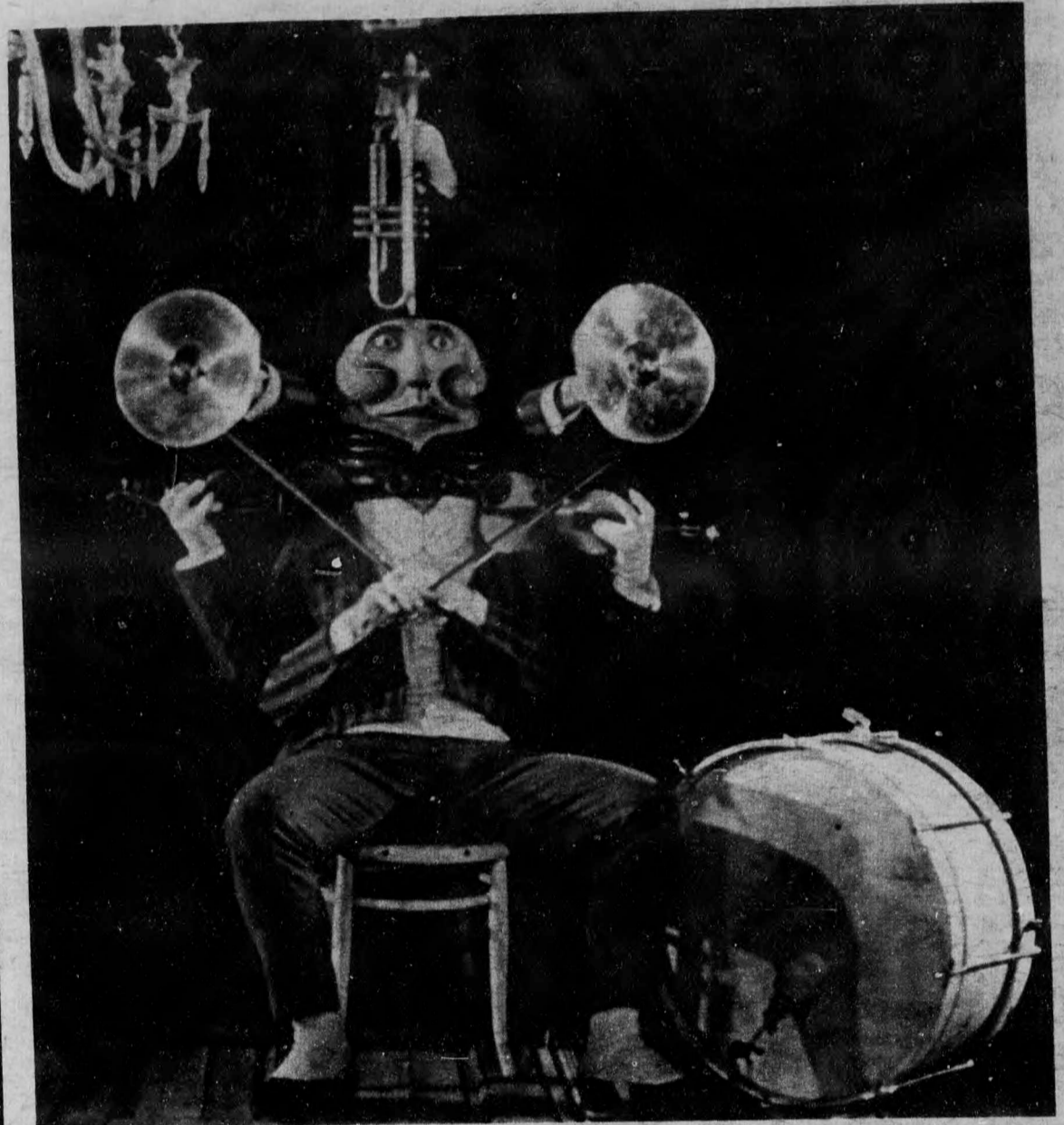
From "The Last Trick of Mr. Edgar", a black comedy by Laterna Magika director Jan Svankmajer of Prague, one of the 26 short films from eight countries included in "The Kinetic Art", the three-program film series which will open January 13.

Call at 472-2528 204 Cherry Avenue, Nashwaaksis, N. B.