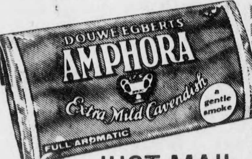
JUST MAIL THIS COUPON TODAY!

Or mail in the coupon below and get a 1/9 lb. pouch FREE. Yes, free. No strings attached. We just want you to try a great mild tobacco taste. That way, we both come out winning. You discover real smoking pleasure . . . and we get a steady Amphora