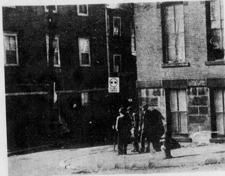
Pictured above, dressed in their smart Mt A blazers, slacks and stetsons are the members of the Mount A Mounties coaching staff. The building on the left is Mount Allison's fine hockey rink. The Building against which the coaches are leaning houses Mt A's school of architectural design. The coaches are very anxious that their players finish their showers and leave the rink before the building inspector arrives.

Some members may be wondering when they have a game scheduled. The draws for the upcoming weekends are posted on the bulletin board outside of the Brunswickan office, in the Student Centre. Should a member not be able to attend that game, please notify their skip. The persons who are disappointed are those who turn up for a game only to find they haven't an opposition to play against. From the constitution of the UNBCC, Article X, 3, "More than two defaults disqualifies the team from the league."