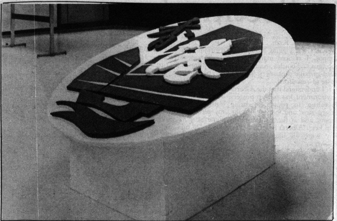
Welcome to the world of the mysterious Orient. East Asian Studies can take you there.

The department offers a wide range of Asian courses including languages, literature and history with related courses in political science, economics and sociology.