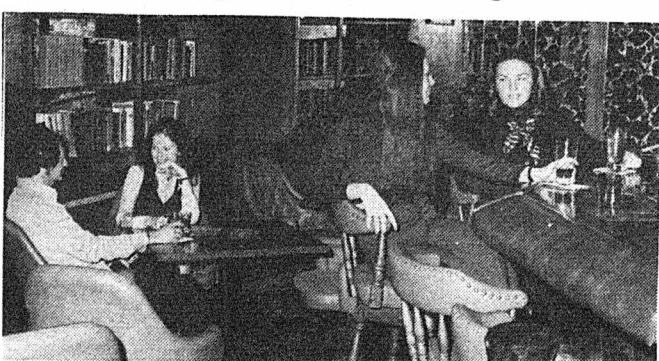
Canadian, French and Italian Cuisine 11113-87 Ave.