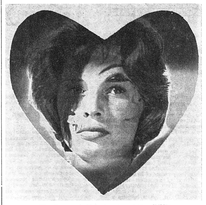
The Gateway's Valentine is watching YOU!