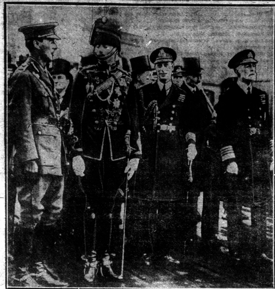
Above Prince Henry (wearing the military busby) and the Duke of York, next on the right, are shown waiting with other officers and high officials at Portsmouth, to greet the Prince of Wales as he landed after his 25,000 mile tour.

The Country Surrounding Damas- cus Seething With Revolt.