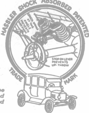
This Twin Type for Front and Rear of Ford Sedans.