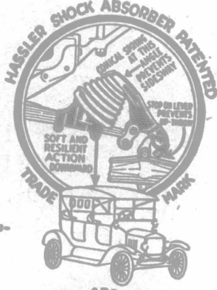
For Ford Passenger Cars.

The conical springs set at the angle shown prevent sideways and allow for the most resilient downward action. The springs compress on either upward or downward movements—do not stretch out of shape—do not allow up-throw. Hasslers last as long as the Ford and make it last.