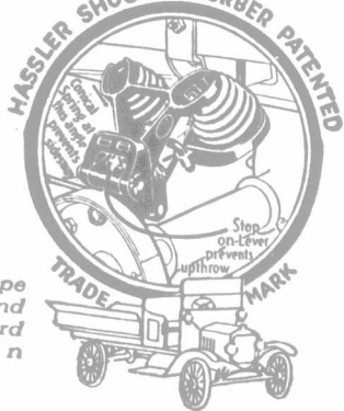
This Twin Type for Front and Rear of Ford One-Ton Trucks.