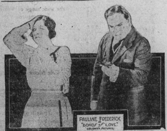
PAULINE FREDERICK in "BONDS OF LOVE"

Miss Young's leading man is Jack Holt, whose capable support of this same star in her earlier Select Pictures, "The Claw," and "The Road Through the Dark," will be recalled vividly. Important also is Tully Marshall, whose screen performances in numerous spectacular productions have made him much sought later. Among the other well known names in this all-star cast are Frank Cam-