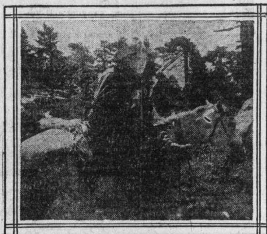
HARRY CAREY in "THE RIDER OF THE LAW"

At Star Theatre Monday, Tuesday and Wednesday next week.