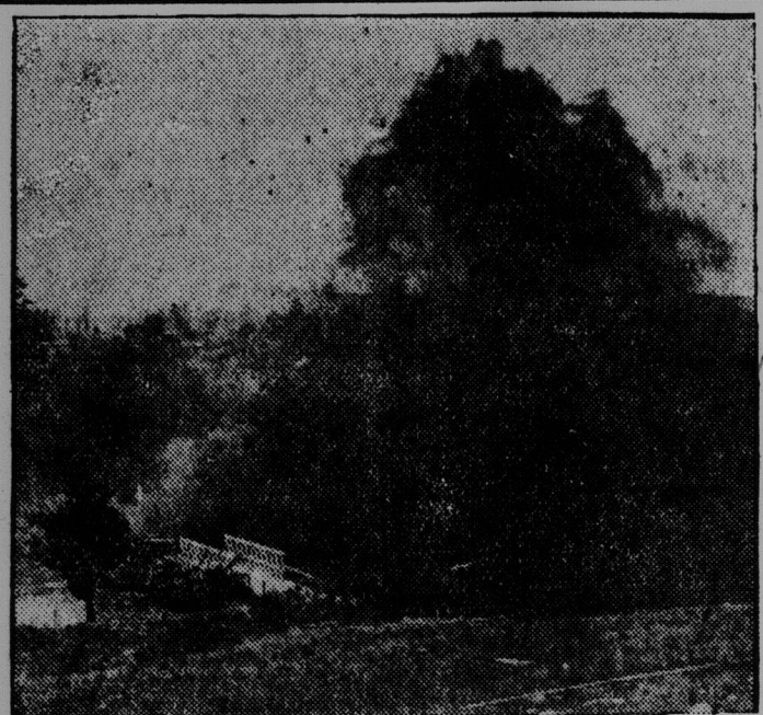
New developments in field artillery are being tried out at Fort Bragg, N. C. The opening shot on this bridge, constructed by military engineers for the experiment, is shown. The shot weakened it, and the next, a direct hit, destroyed it.