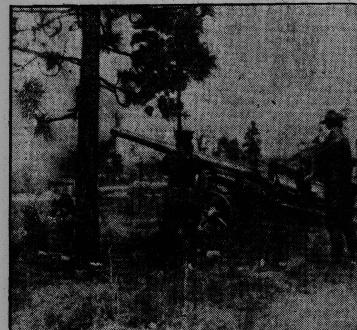
Here are shown the new developments in field artillery which are being tried out at Fort Bragg, N. C. The photo shows the firing of one of the new six-inch field guns. Photo shows the smoke just breaking from the mouth of the gun.