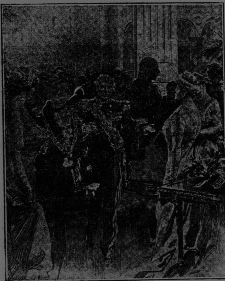
One of the many functions of the King's Birthday in Old London. This is really the culminating point of the day's events. It was held this year at the Foreign Office, where the general Italianate Hall lent itself peculiarly for such gatherings. Prominent figures are: The Princess Patricia (the tall figure on the right), Lord Chancellor Haldane, Premier Asquith, the Duke of Connaught, Countess of Warwick and Lady Somerset.