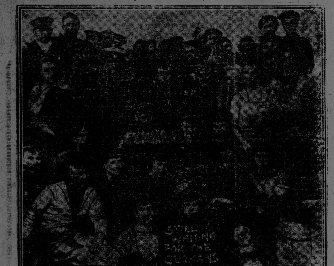
All these jolly fellows went down with their ship in the Battle of Jutland. The photograph was taken at a song among the stokers and the negative mailed to England on the last mail which left before the battle.

THE EVENING TIMES AND STAR, ST. JOHN, N. B., MONDAY, JULY 3, 1916