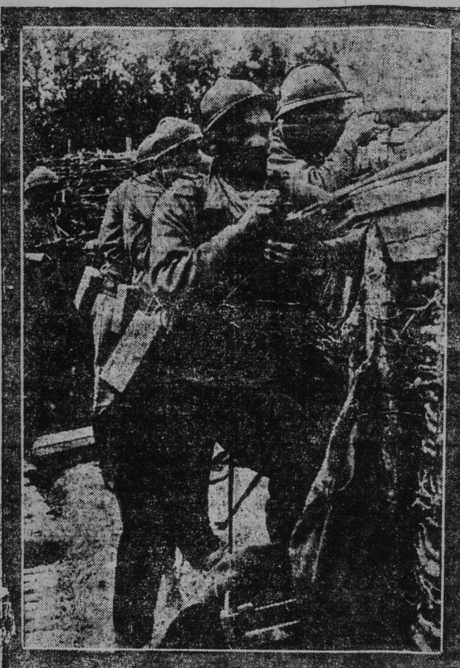
With the French on the Western Front. Photo shows French soldiers preparing to repulse an attack.