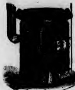
ECONOMY Warm Air Furnace.

Steam Heating! Warm Air Heating! Hot Water Heating!