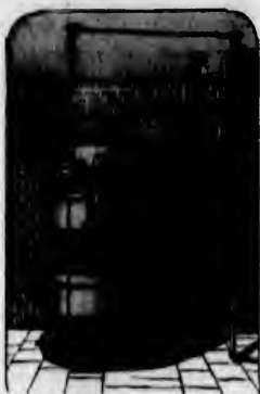
ECONOMY Steam and Warm Air Combination Furnaces.