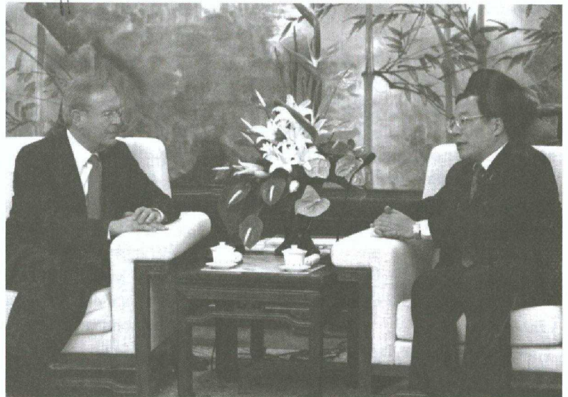
International Trade Minister Jim Peterson meets with Zhou Yupeng, Vice mayor of Shanghai.