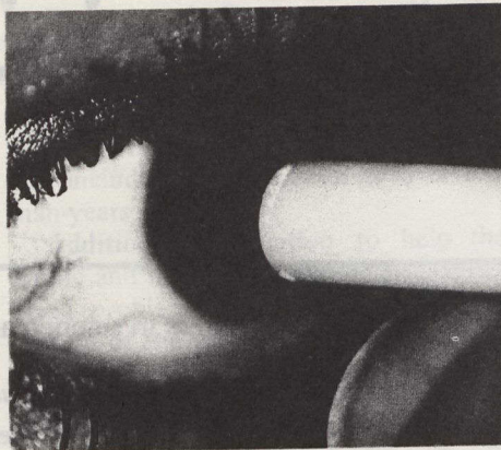
The Echo-Oculometer (above) measures the axial length of the eye.

A device that uses ultrasound in the accurate and painless measurement of eye parameters has reached the marketing stage. Developed by the Division of Electrical Engineering, the Echo-Oculometer is being manufactured by Radionics Ltd. of Montreal. Following a stringent series of tests, the device has been licensed for sale in the United States by the U.S. Food and Drug Administration. The instrument has a particular application in determining the axial length of the eye before implantation of artificial lenses.