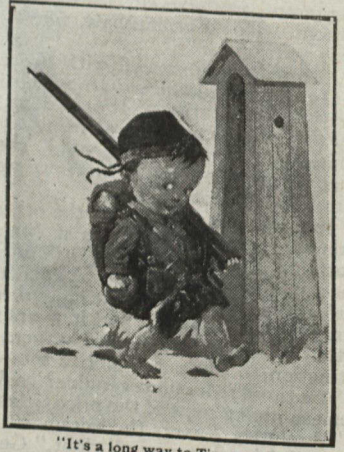
'It's a long way to Tipperary'

This great picture, reproduced from the famous painting, in full colors, on high art paper with deep Mat Border, size 15x12, all ready for framing, is yours for the asking.