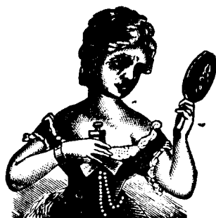
A skin of beauty is a joy forever.

Be sure you get the genuine in Salmon color wrapper; sold by all Druggists, at 50c. and $1.00. SCOTT & BOWNE, Belleville.