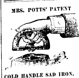
COLD HANDLE SAD IRON.