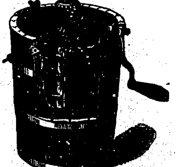
SOMETHING NEW IN ICE CREAM FREEZERS. REILLY & DAVIDSON