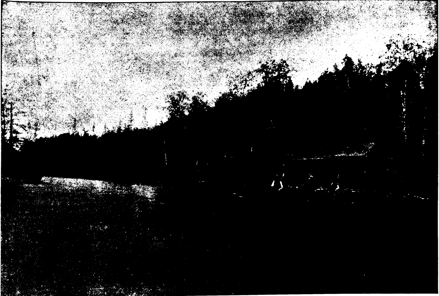
GASPE FISHING SCENES.—“The Bouleau.”

$4.00 PER ANNUM. IN GREAT BRITAIN, 21s. 6d. 10 CENTS PER COPY. " " 6d. 6d.