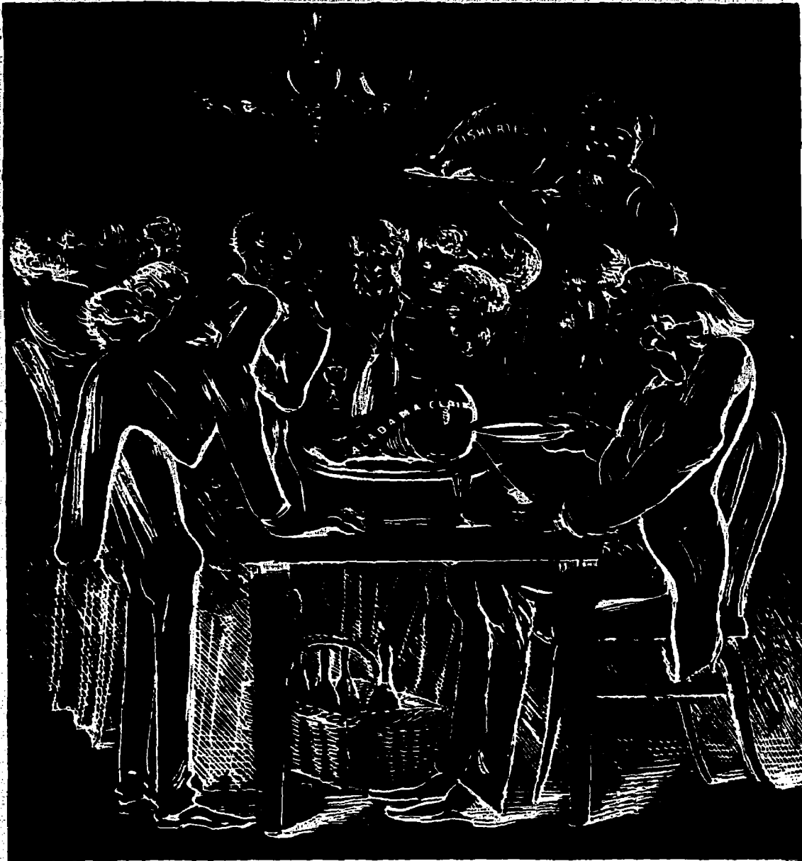
THE HIGH JOINT COMMISSION.—SEE PAGE 154.