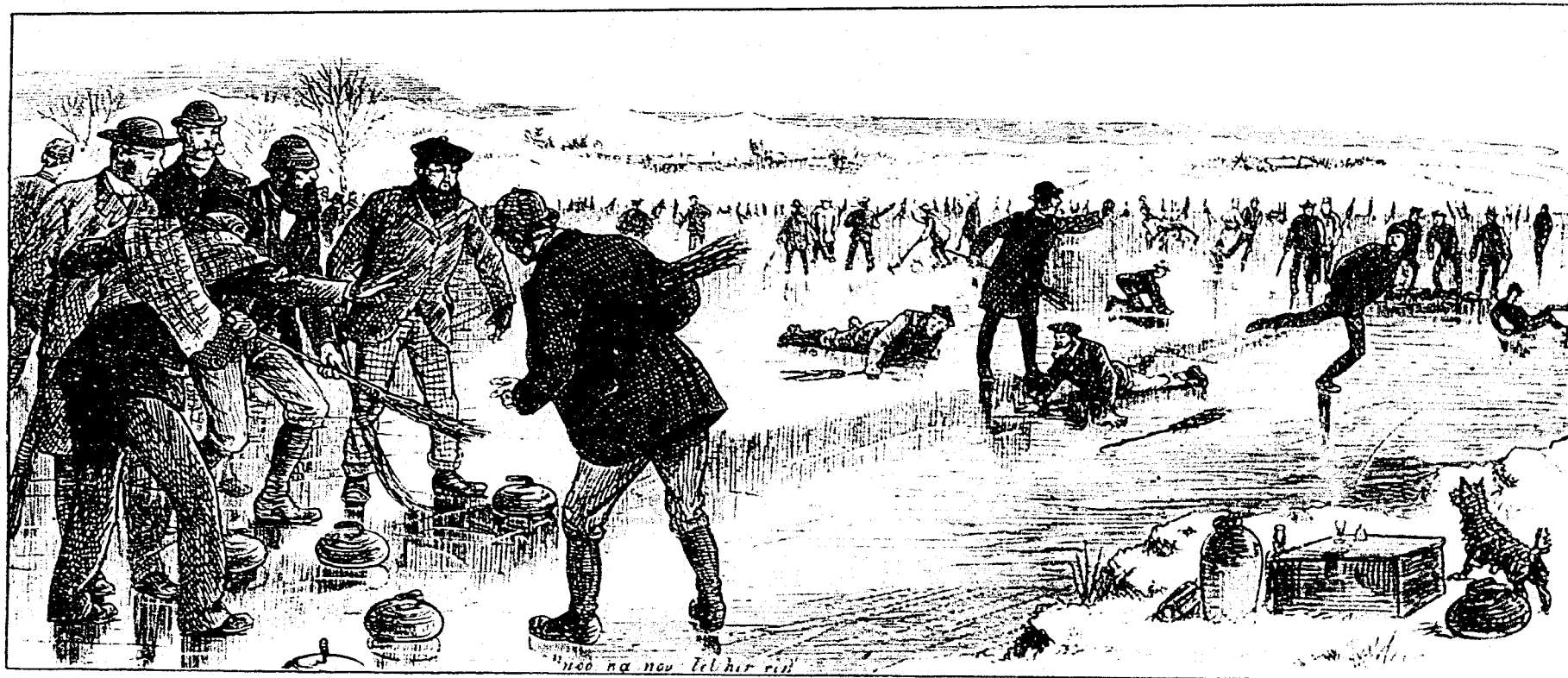
A CURLING SCENE IN SCOTLAND.