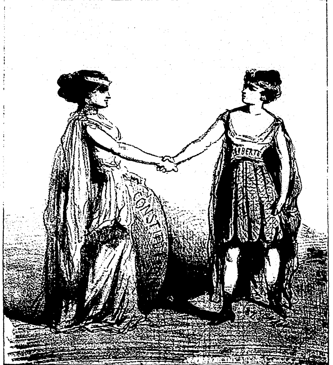
Are you serious?