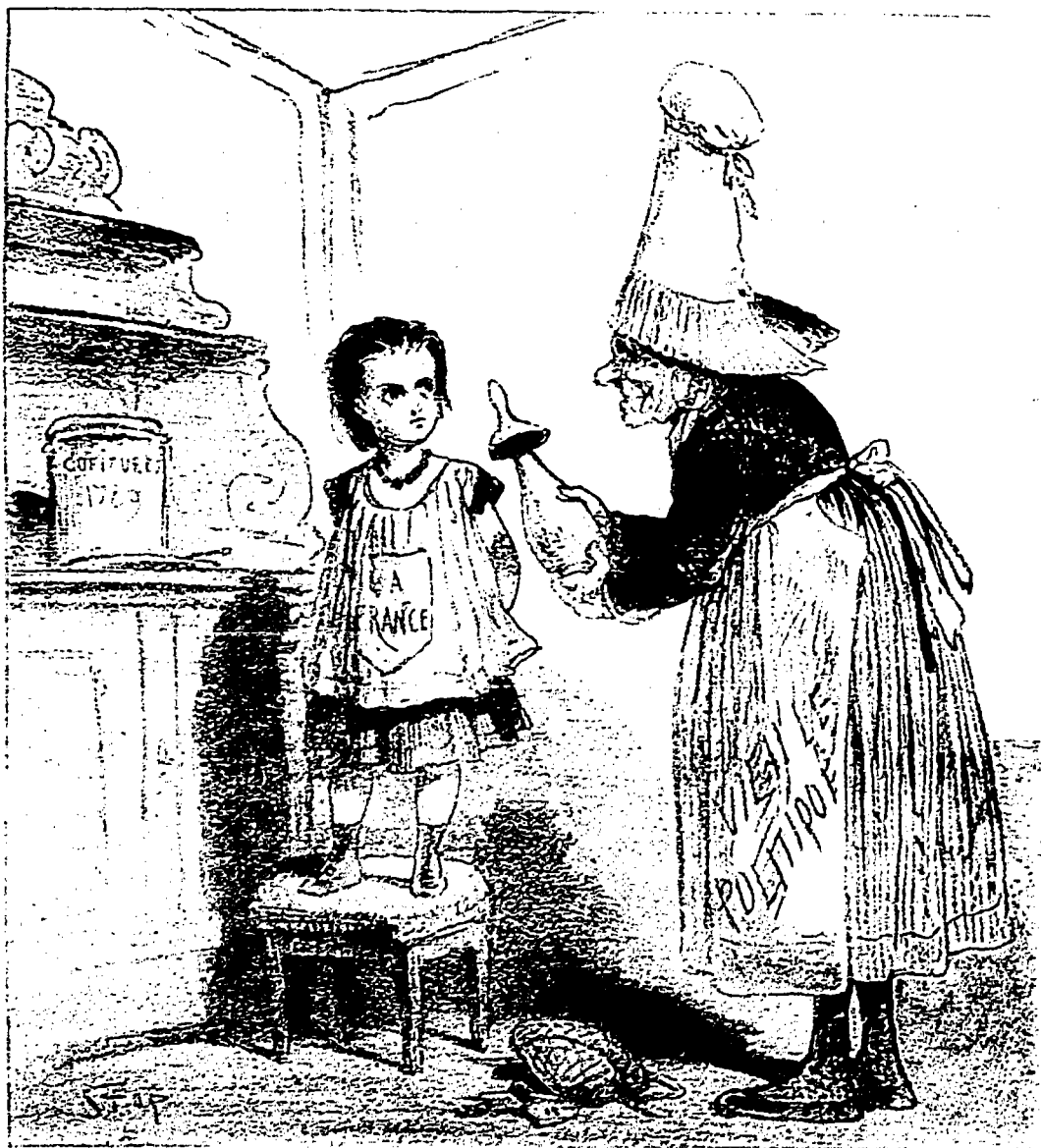
Thank you! I am old enough to help myself!