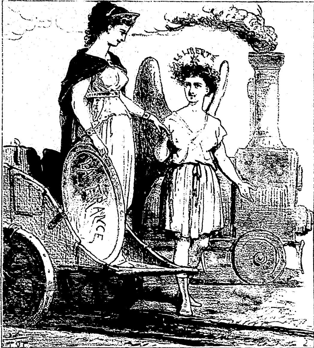
Come, Madame, here is the new Car of State.