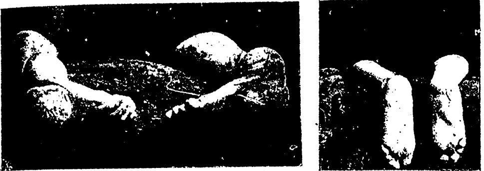
Fig. 3, Case 2.