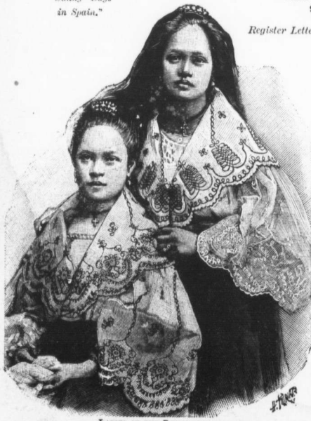
LADIES OF THE PHILIPPINES.