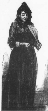
WITH FAN AND MANTILLA.