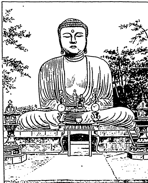
BUDDHA, CHIEF GOD OF THE JAPANESE.

to be 72,000 Buddhist temples in Japan, and 56,000 priests and monks. But it is also said that "Buddhism marches no further, fights no battles, wins no victories." Her priests oppose and sometimes