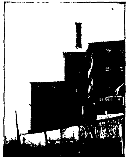
The same Chimney AFTER the American stoker was installed.