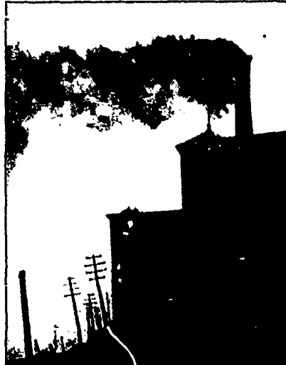
Photograph of a Chimney BEFORE the American Stoker was installed.