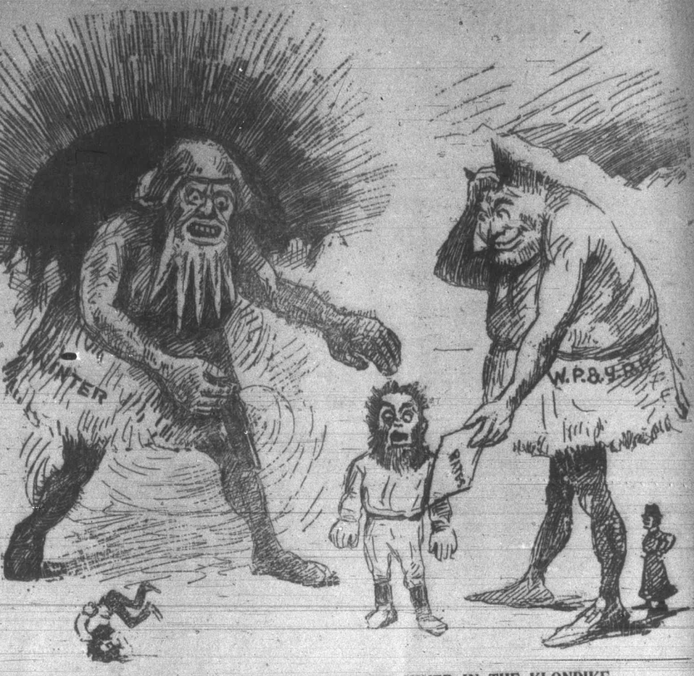
TWO EVILS WHICH CONFRONT THE MINER IN THE KLONDIKE.