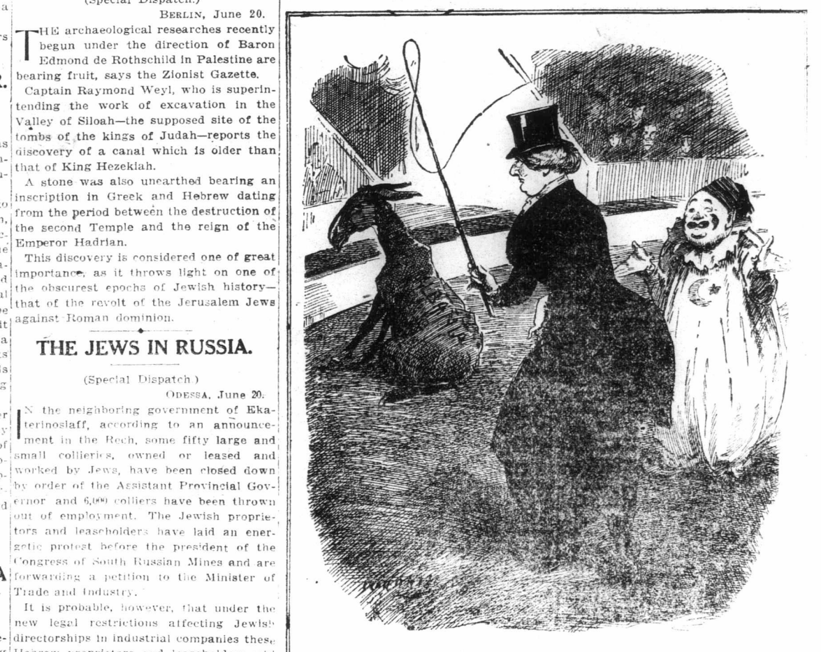
THE CIRCUS OF EUROPE. Tenner (to Europa, ring mistress). "INFIRM OF I CAPOSET GIVE ME BACK THE WEST