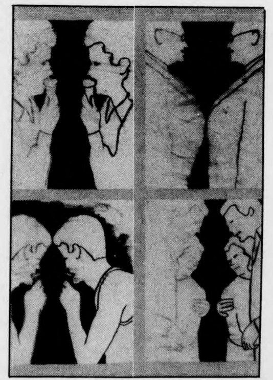
Ida Applebroog's drawings further explore loneliness, this time in a social context.

with one's spouse. Alone, we can rationalize to our heart's content. In Applebroog's Mirror Image series of raw, charcoal drawings we are shown, for example, a man shaving in a mirror with his pale reflection opposite him. Although captioned by "I don't know you," it's a little early in the morning for metaphysics as far as this character is concerned. The way this man is slumped over, the drawing might even be retitled, "No philosophy. Just a shave."