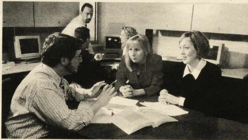
ITI students at work in rapid application development teams which simulate the IT workplace.

Atlantic Canadian high-tech companies have a voracious appetite for highly-skilled IT employees. ITI graduates are of particular interest to them. Thanks to ITI's innovative collaborative problem-solving environment, not only are graduates