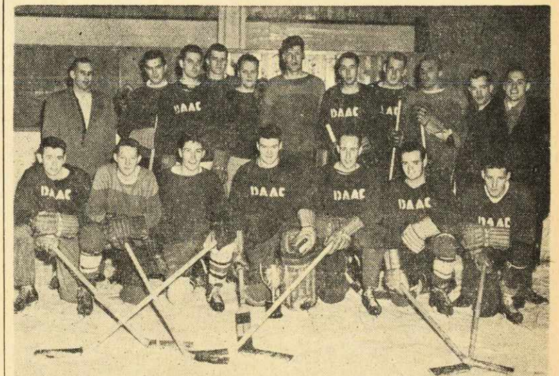
LEAGUE CHAMPIONS—Shown above are the members of the Law Interfac hockey team who downed Commerce 5-3 on Munro Day to take the league championship. The Lawyers finished third over the regular schedule.