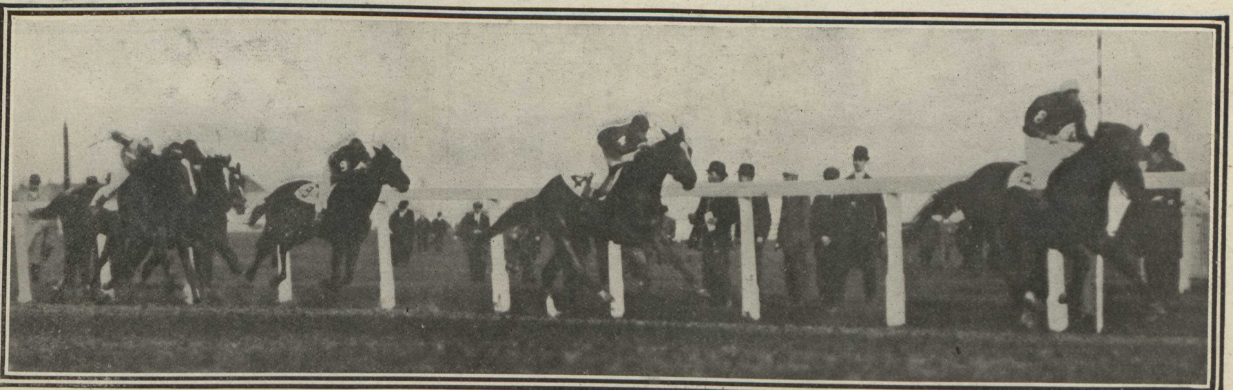
On Saturday the Duke Attended the Opening of the Woodbine Races and Saw the King's Plate Finish as Shown in This Picture. 1st, Keresy; 2nd, Amberite; 3rd, Rustling