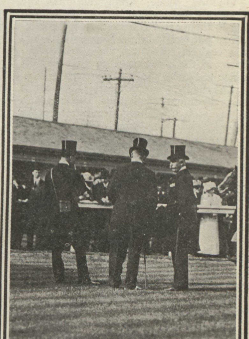
The Duke Takes a Stroll About the Woodbine Paddock.