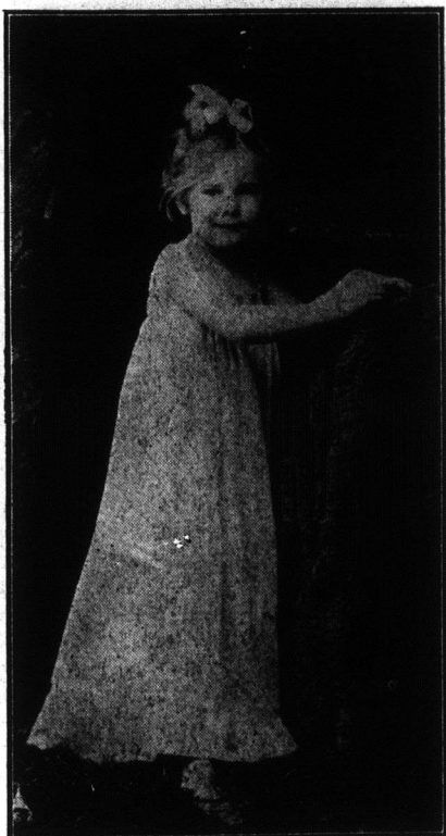
A Youthful Explorer.

"He took two of the tops and handed the boy a ten-dollar bill. As the child left the hotel in a somewhat dazed condi-