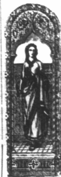
FIGURE and Ornamental MEMORIAL WINDOWS AND GENERAL Church Glass. Art Stained Glass For Dwellings and Public Buildings.

Our Designs are specially prepared and executed only in the very best manner.