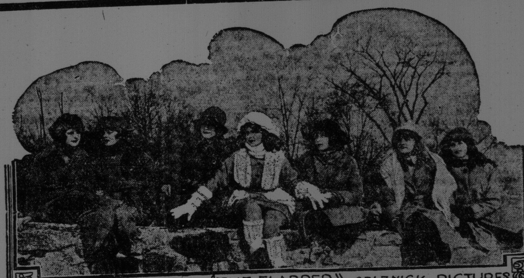
OLIVE THOMAS in "THE FLAPPER" SELZNICK PICTURES

SANTA CLAUS Christmas Sketch Starting Friday Mat. 35 Children Will Take Part in Play ON FRIDAY