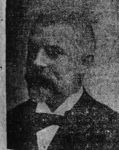
HON MR. FIELDING. Minister of Finance, Who Will be Prominent During the Coming Session of Parliament.

ConstitutionalDemocrat Too Vigorous in His Denunciation of the Government.