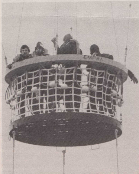
A collapsible, open-top ring net can pick up as many as 20 people in one load when lowered into water. The sides drop to allow easy access and exit.

Mr. Bradley says that this device could have saved the lives of many