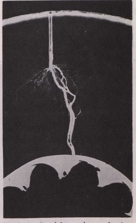
Insulation breakdown, the result of many hours of electrical stress under test conditions. Partial discharges form at the tip of a metallic needle which has been placed in the insulating material.

A short circuit in a power-cable results not only in economic loss to electrical companies but inconvenience and expense to industry and the general public. The laying of these cables is a costly business involving street excavations and disruption to offices and factories. Once laid, the cable is expected to convey electrical power without maintenance for the next 40 years. This life-time may have been established for a particular line of powercables, but what is the supplier to do if he wishes to introduce a new manufacturing process or employ new materials? Is he to test his product over