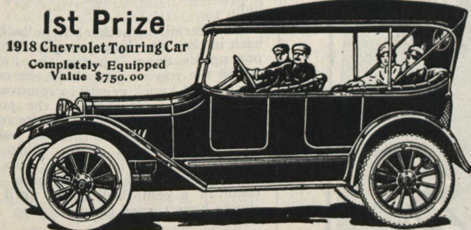
1st Prize 1918 Chevrolet Touring Car Completely Equipped Value $750.00