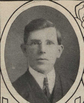
M.L. CORNELL PHYSICS