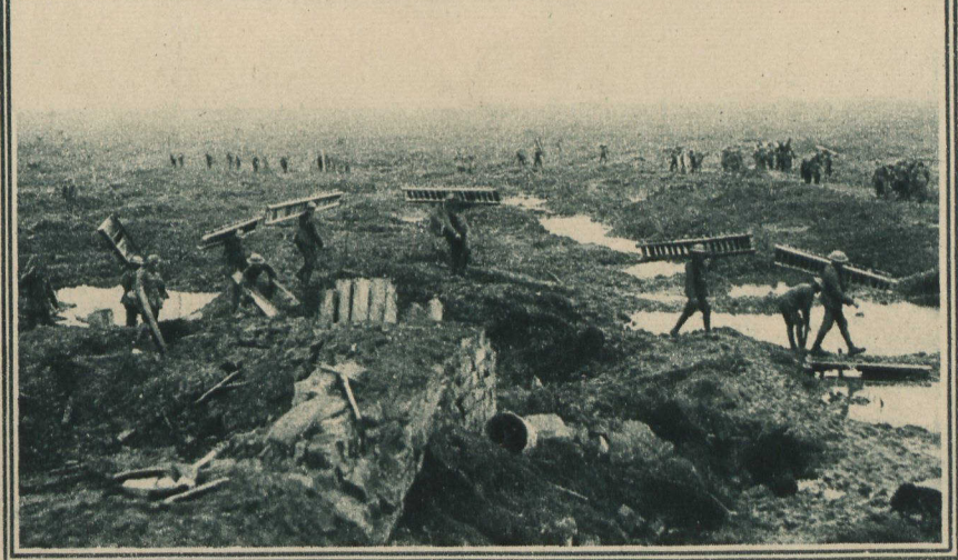
This picture gives a vivid idea of the desolation of Passchendaele. A long procession of Canadians carrying trench mats across the watery waste.