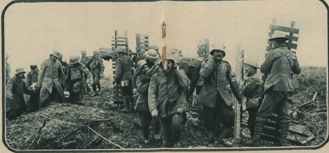
Canadian Pioneers, carrying trench mats up to the new lines, stand aside to allow the passage of Germans bringing in their own wounded. Without these mats progress would be impossible.