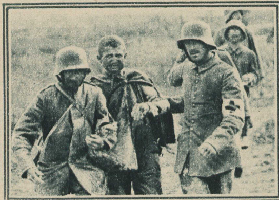
A good excuse for being taken prisoner: German Red Cross men bringing in wounded Huns.