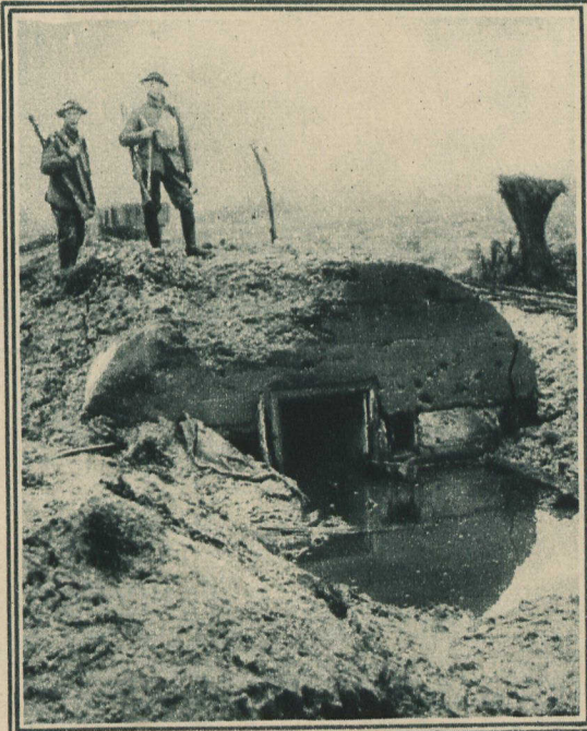
Pillbox Island. Kings of a waterlogged castle in the swamp round Passchendaele.