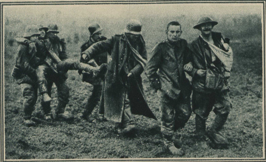
Frog-marching a wounded man. The first stage of the journey of some Boche prisoners to Blighty. They were pleased enough to go.