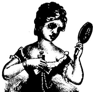
A skin of beauty is a joy forever.