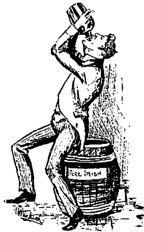
THE DOWNPOUR OF THE SPIRIT.