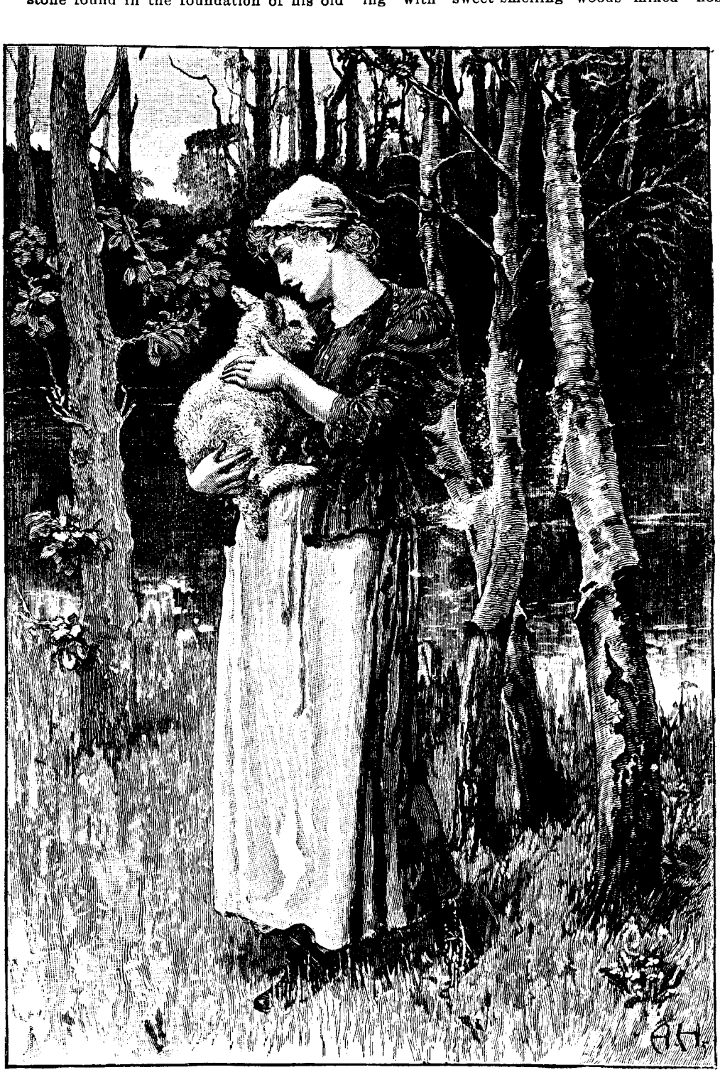
"A WEE BIT SILLY LAMMIE."—(See Lesson Notes.)