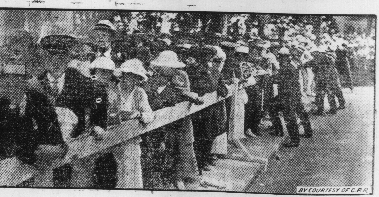
The Prince's Visit to Montreal.—Keeping the crowd back, near Windsor Station.