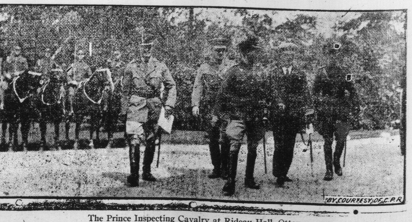
The Prince Inspecting Cavalry at Rideau Hall, Ottawa.