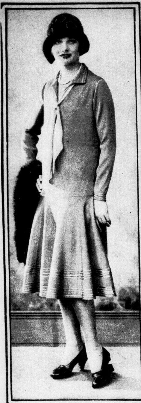
A simple, smart street frock of green French flannel