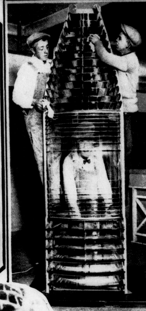
Three guesses — what is it? It's the world's largest lighthouse lens, magnifying light a million times, for use on the United States Atlantic coast