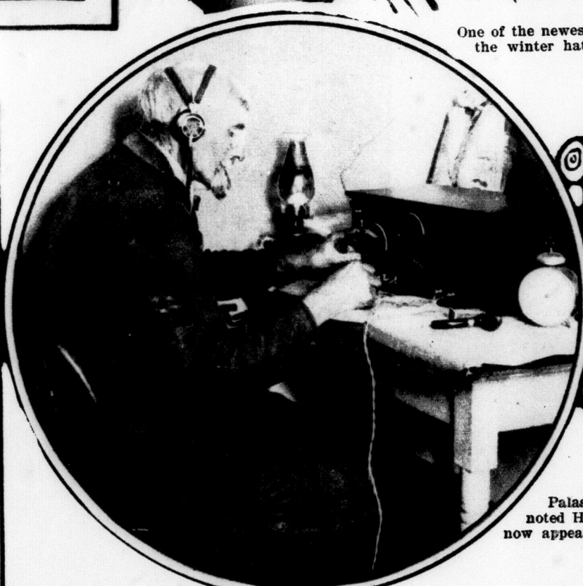
Birdseye Center's most enthusiastic radio fan