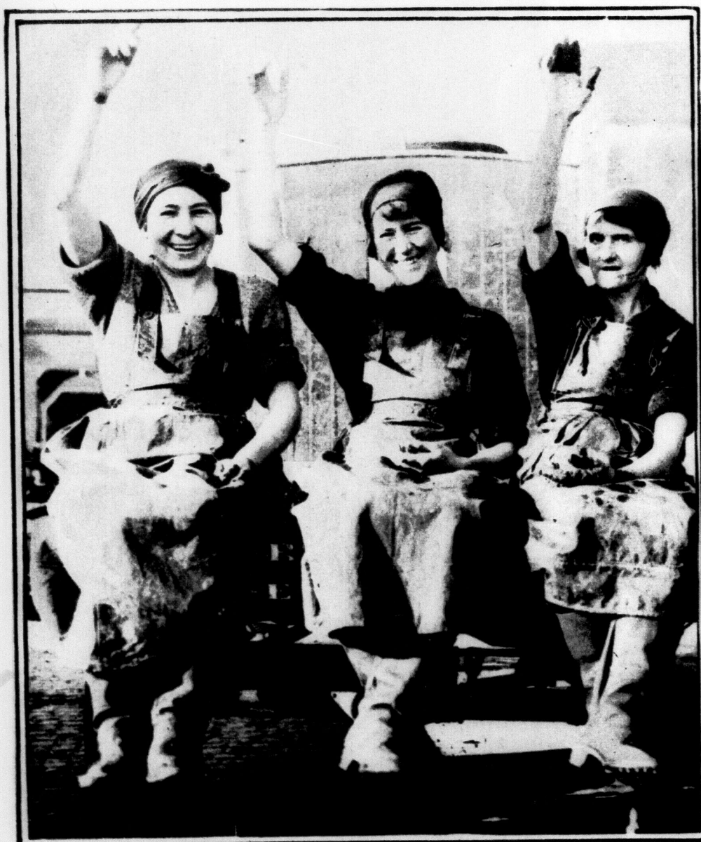
Happy fisher girls at Yarmouth, England