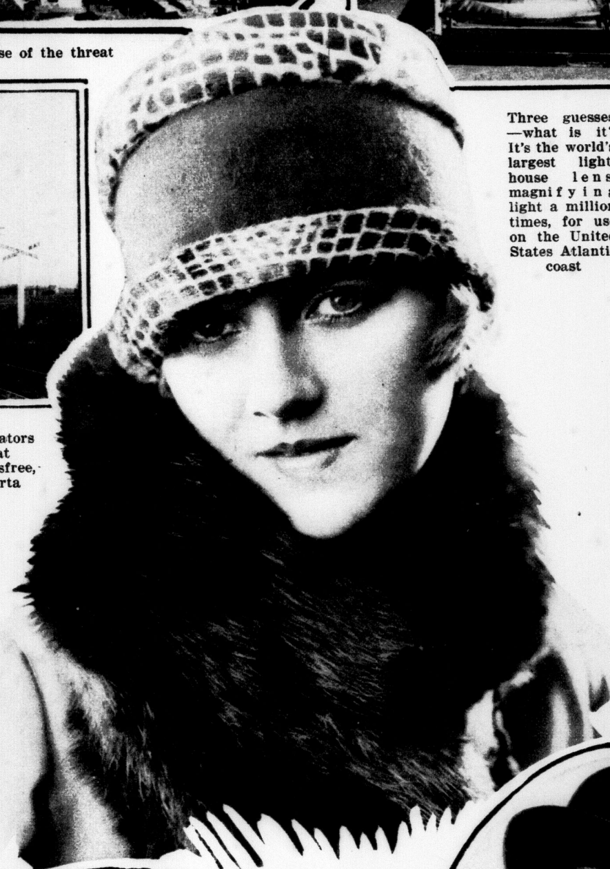
One of the newest of the winter hats