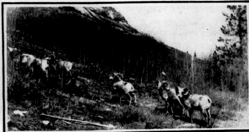
Mountain sheep in the Canadian Rockies