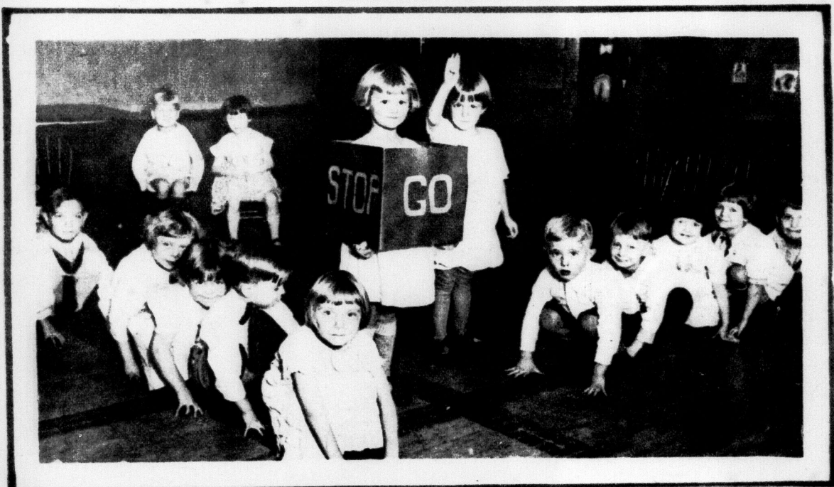
Traffic practice in a Chicago kindergarten