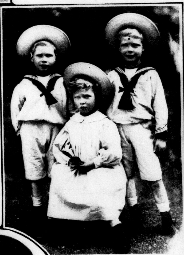
Once upon a time there lived a little princess and two little princes. Left to right: the Duke of York, Princess Mary, and the Prince of Wales