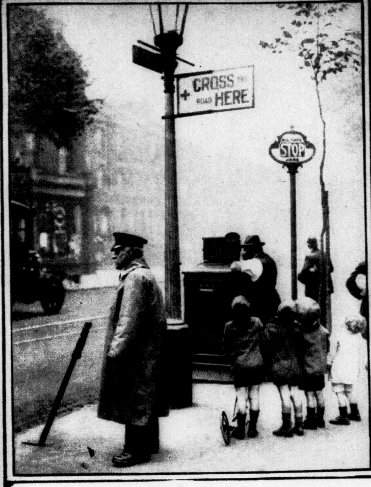
Signs in Southwark, England, advising pedestrians, especially children, where to cross the street