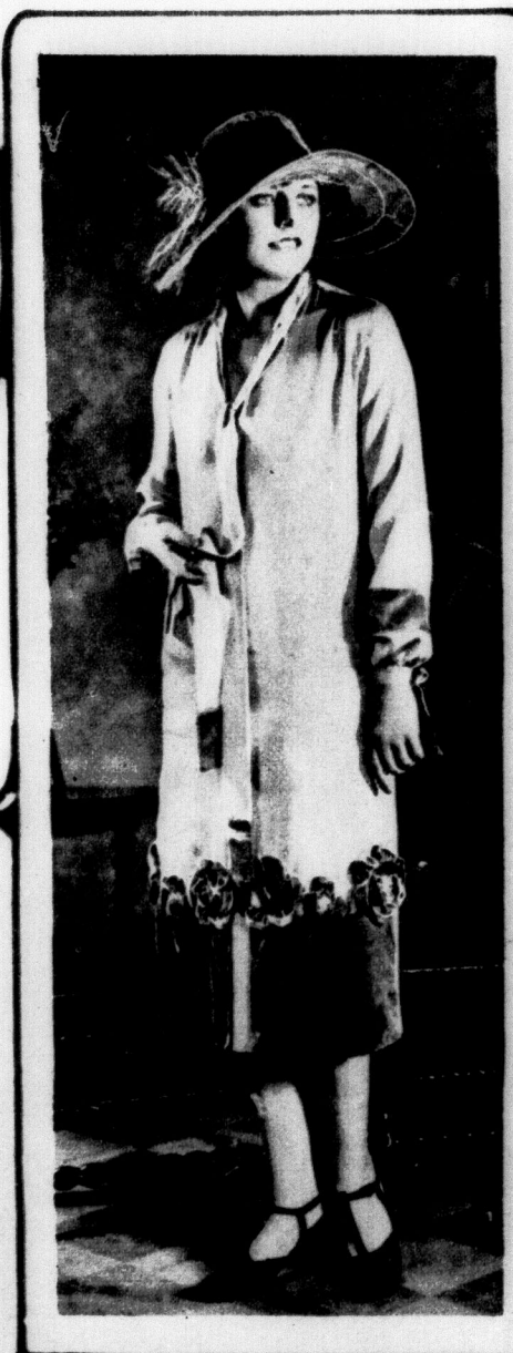
A rose pink charmeuse coat frock